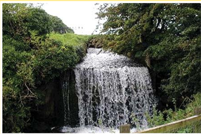
15kW example of scale: stream