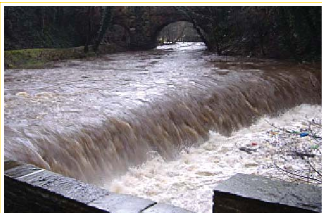
100kW example of scale: river